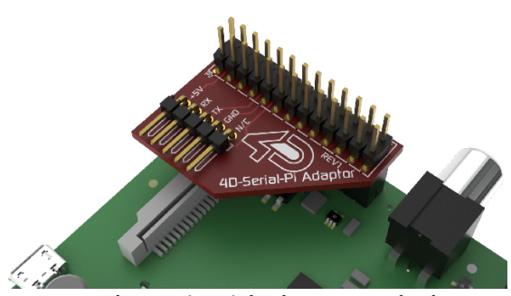
4D Raspberry Pi Serial Adaptor attached to a Raspberry Pi