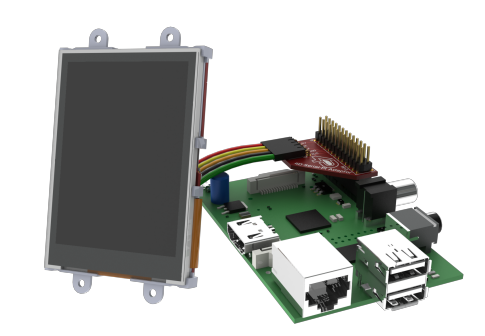
4D Raspberry Pi Display Module Pack (4D Raspberry Pi Serial Adaptor is 1 part of this pack)